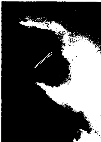
Fig 1.—Tomogram of case 1, with arrow indicating erosion of sella turcica and mass extending into sphenoid sinus.